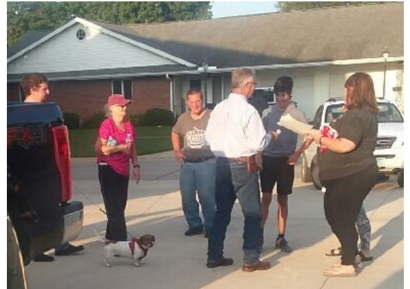
Community night of prayer for the schools. About 30 people came by to get a packet of prayer requests and scriptures to pray as the drove, walked or biked around the schools in Clarion.

IDES (International Disaster Emergency Services) is praying each Tuesday, all during the day. Call 1-317-773-4411. Let them know your concerns and they will pray for them/you.