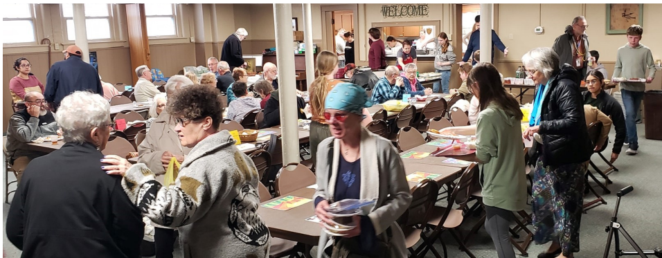
Serving others, and being served. The day was a huge success.