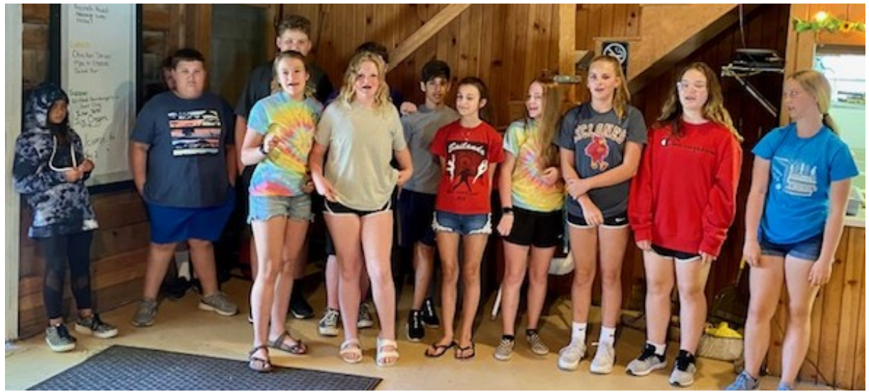
Mostly Clarion kids.. Had to sing since the group got a box filled individual gift bags